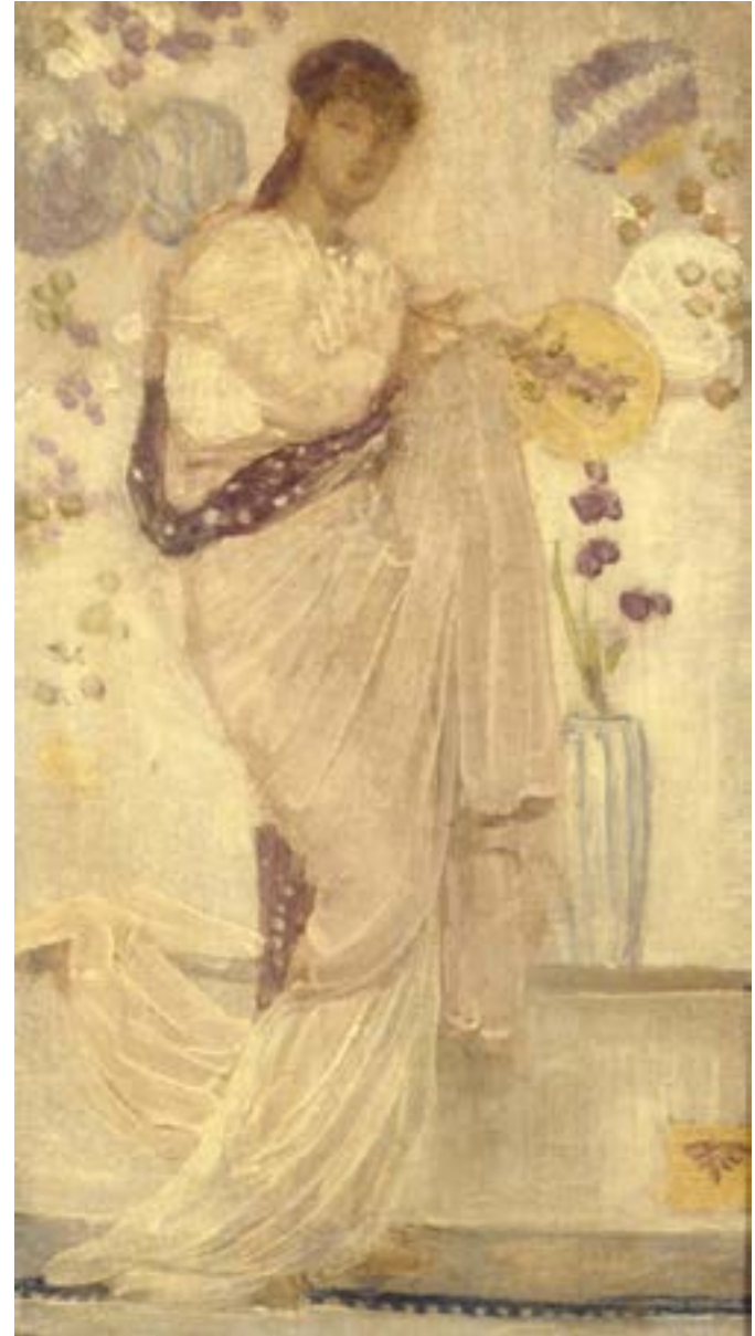
James Abbott McNeill Whistler, Sketch of a Figure with Flowers and Japanese Fans, 1867-1870, 19 x 13 ½ x 2 ½ in. Purchase made possible by the Fine Arts Fund, 1953. Collection of the Maier Museum of Art at Randolph College, founded as Randolph-Macon Woman's College.