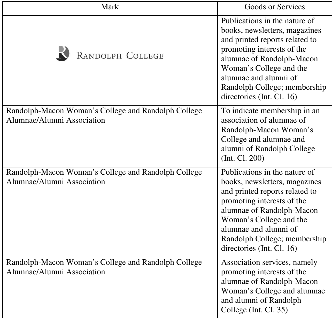
EXHIBIT B The RC Marks