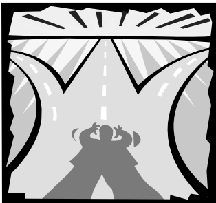
Being an extern can lead to informed decisions!