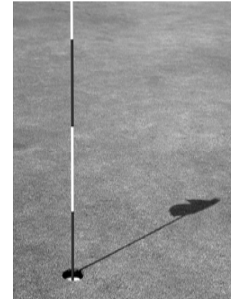
Score a hole-in-one in your career planning through the Externship Program!